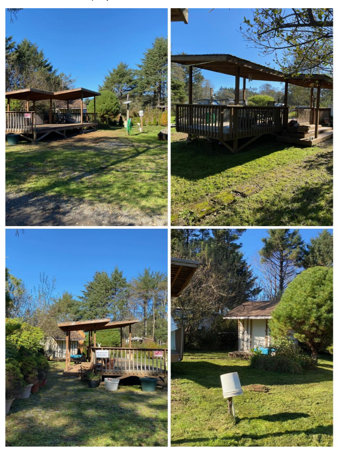
Block 6 Lot 24 $119,800 PRICE REDUCED!! $99,000

Large lot, storage shed with bunk bed. Fire pit. 40ft 2008 Cyclone with three slides. The kitchen sink and floor have been recently replaced. Cargo remodeling with slide door, also newer deck. Most items stay: tables, bunk bed, refrigerator, washer, dryer and microwave.