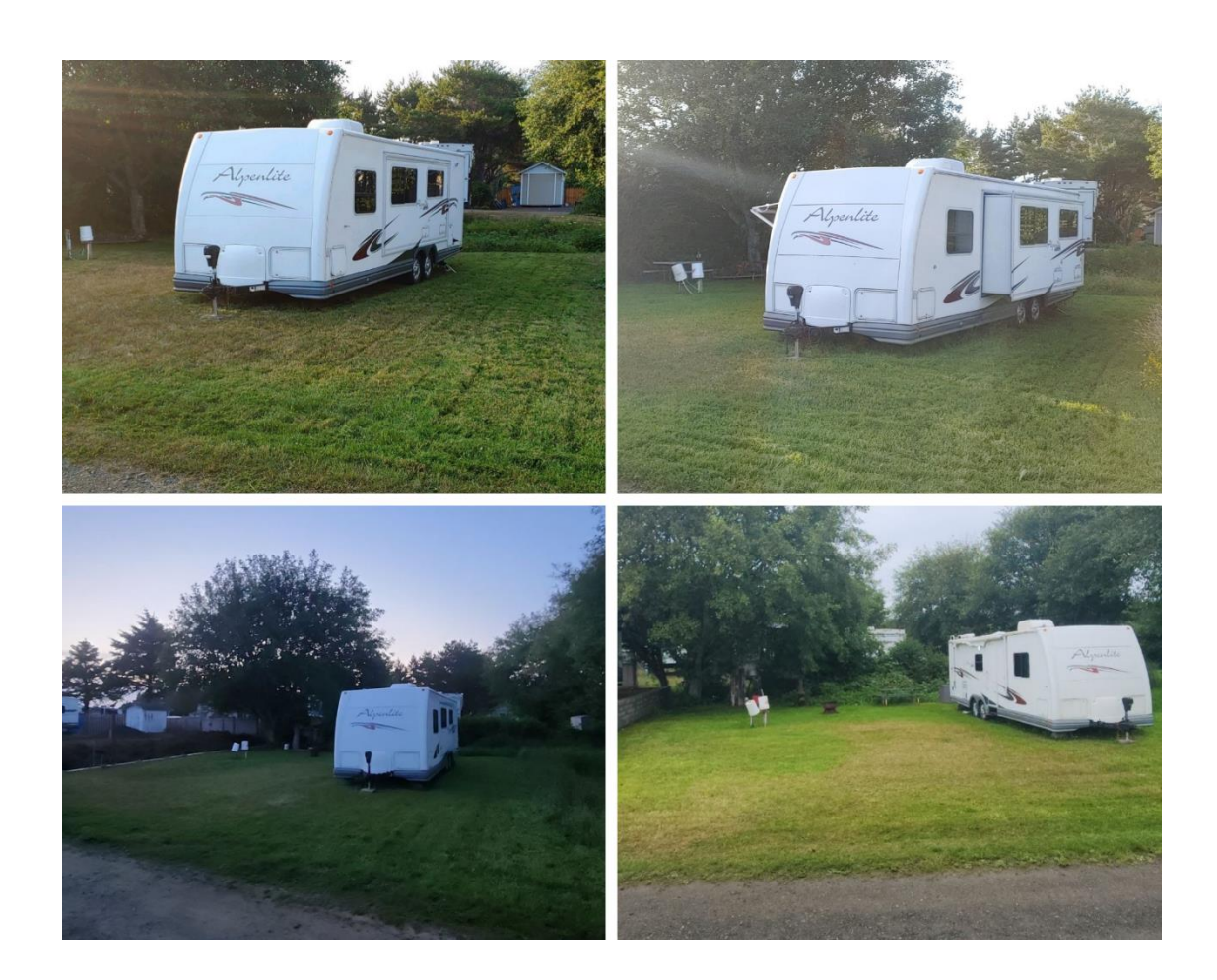
Block 3 Lot 34 $145,000 PRICE REDUCED!! $135,000

All sales must go through OSORC (Ocean Shores Outdoor Recreation Club) office call 360-289-2318 to schedule a time to see this property and land. We are on Lot 3/34 in the RV area with 2017 39ft Vilano 5th wheel 365RL, 10 x 12 cabin complete with shake siding and immaculately completed interior, front porch overhang composition roof. Cabin has a new leather dinette with bench storage, that converts to a twin bed and a new Murphy bed cabinet/Queen with memory foam mattress. 5th wheel has a new residential refrigerator, new leather theater seats/electric, new sofa sleeper Queen memory foam air bed, King size bedroom complete with hookups for washer and dryer in bedroom if needed. Generous RV bathroom and shower. 2 TVs. 2 ac's and much, much more. 16ft of storage sheds outside separate from RV and Cabin. Wooden picnic bench is included. Outdoor furniture is NOT INCLUDED. This lot is always high and dry, one lot away (half a block) from beach trailheads 2 blocks through the dunes and your on the beach where clamming, walking, riding or kiting occurs. 3 doors down from public